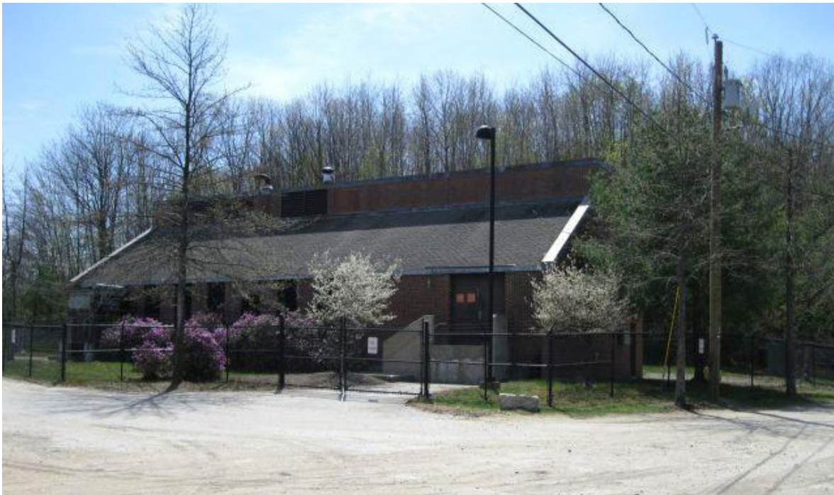
Figure 7 – River Street Sewer Pump Station

There are only two buildings remaining on the property today. One, pictured below in Figure 7, is the River Street Sewer Pump Station. This 5,700 square foot brick building was built in 1990. This one story building contains the largest sewer pump station in the city and is a fixed feature that must remain.