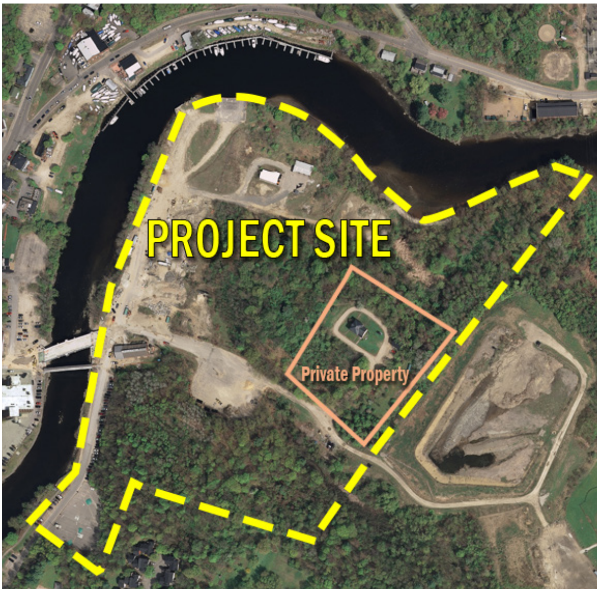
Figure 1 - Project Site Aerial Map

At the conclusion of the RFQ process, a short list of respondents will be invited to submit more detailed proposals in a second stage Request for Proposals (RFP).