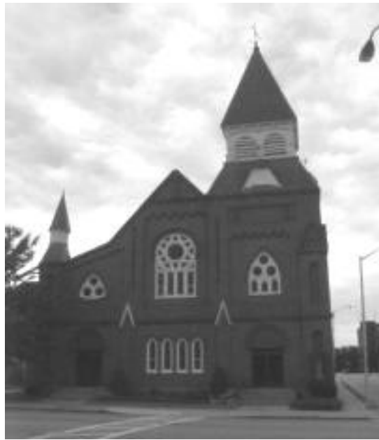
Baptist Church, c1895