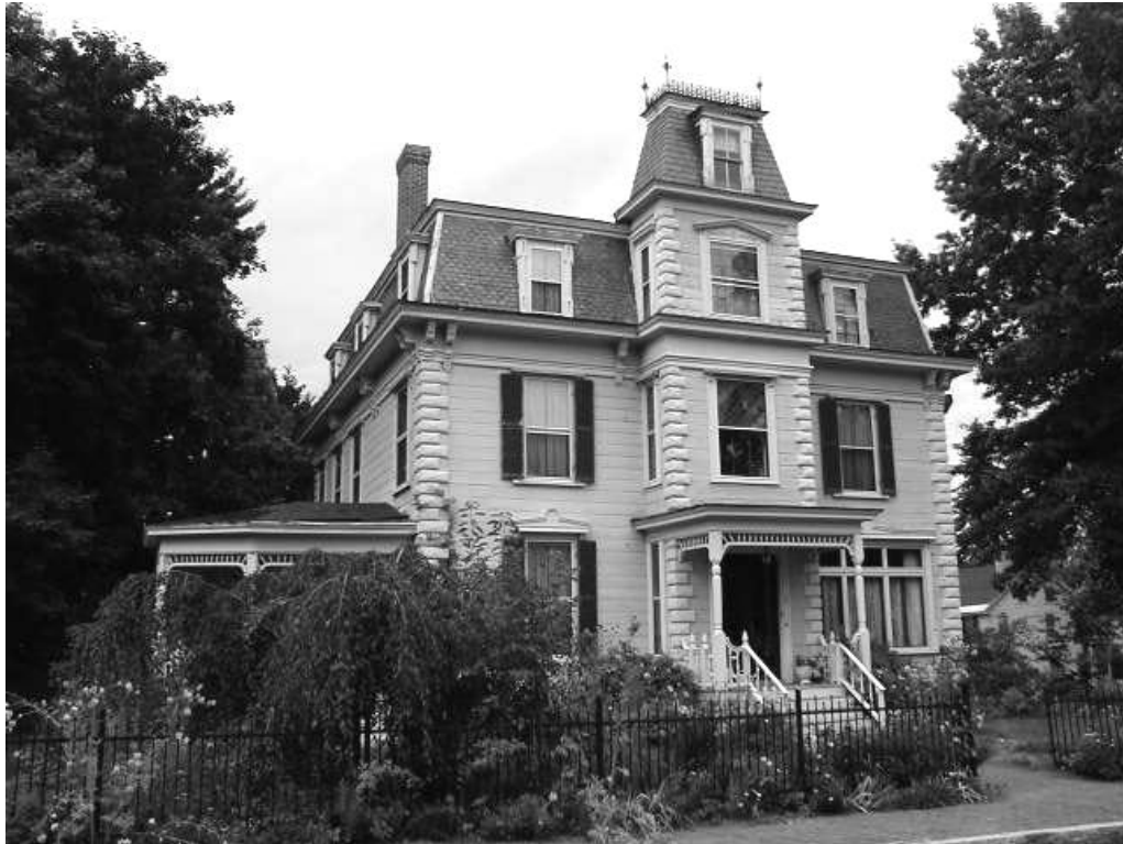
Andrew Young House, 1870