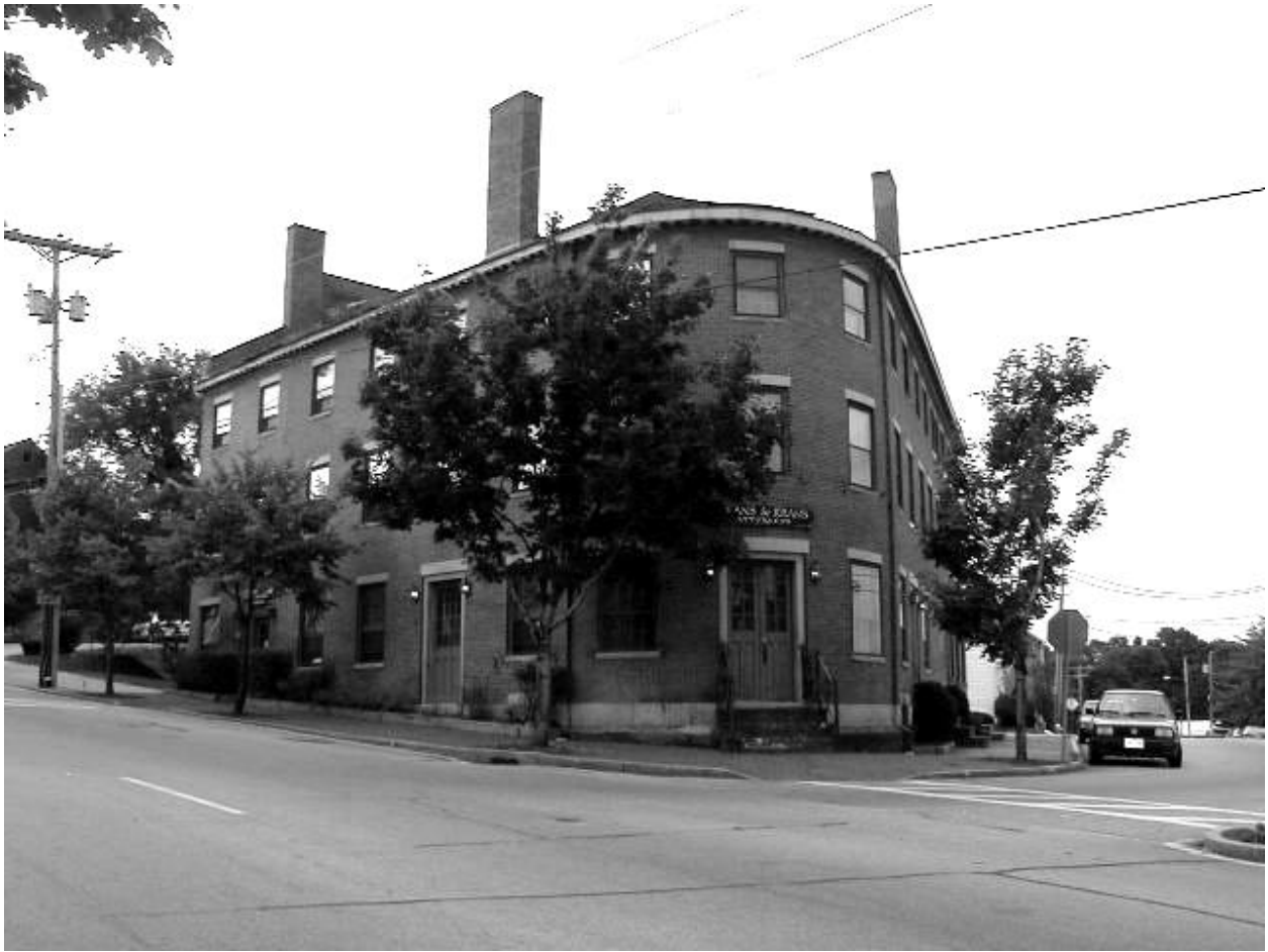
Hosea Sawyer Block, 1825