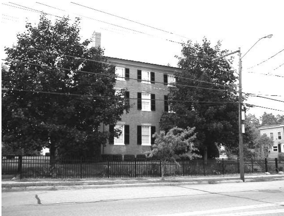
Williams/Hale House, 1814

One of the agricultural resources that has survived is the Varney/Horne Homestead on Blackwater Road that was settled in 1810. Following the embargo of 1812, many of the wealthy entrepreneurs invested their money in building fine homes because they could not invest in shipbuilding and trade. Some of the same carpenters and woodworkers constructed these new homes. These fine Federal mansions are concentrated in the area known as Tuttle Square and scattered throughout the city as agricultural settlement continued throughout the City. Brick became a popular building material in Dover after the fires in Newburyport and Portsmouth had made this material a necessity as well as an aesthetically desirable material. Dover's coastline supported numerous brickyards which supplied brick throughout the region, and many of the new mansions and industrial buildings were built from the brick from these brickyards. Significant examples include the William Woodman House, c. 1818, and the John Williams/John Parker Hale House, c. 1814. (John Williams was the agent of the first cotton mill.), which are now the buildings of the Woodman Institute.