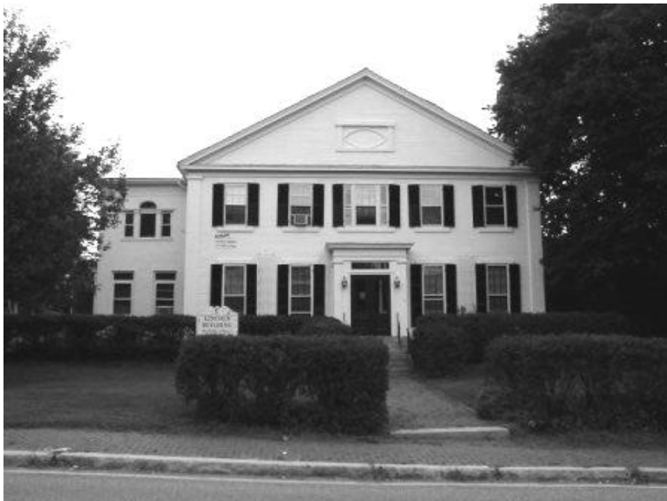
Lincoln or Corporation House, c1831