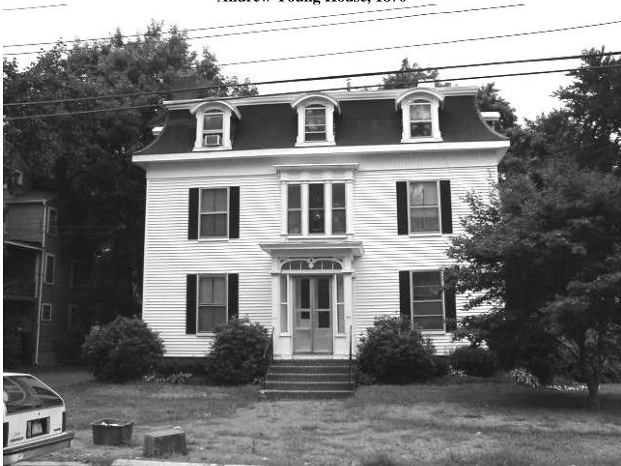
Dover's First Hospital, 1897