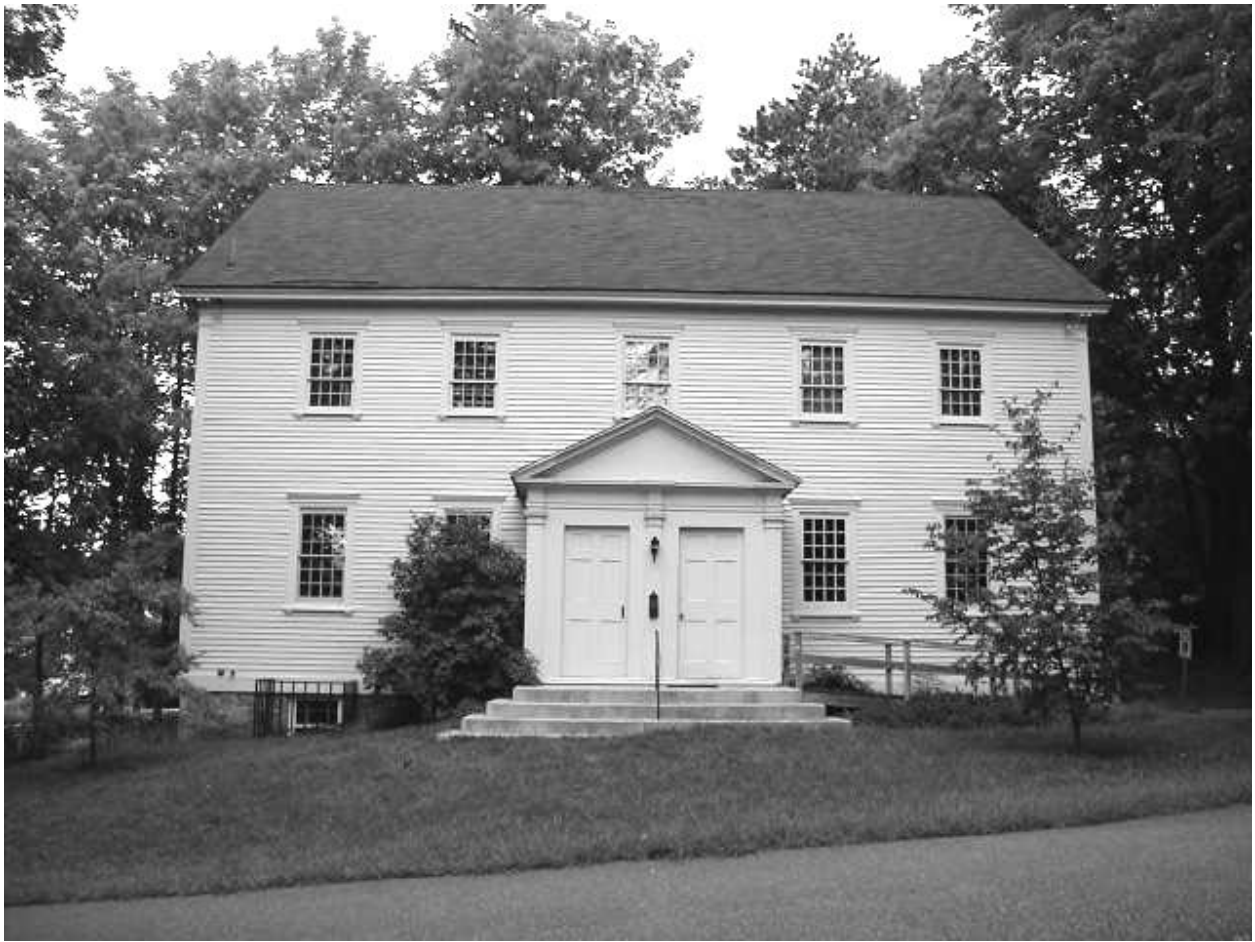
Dover Friend's Meeting House 1768