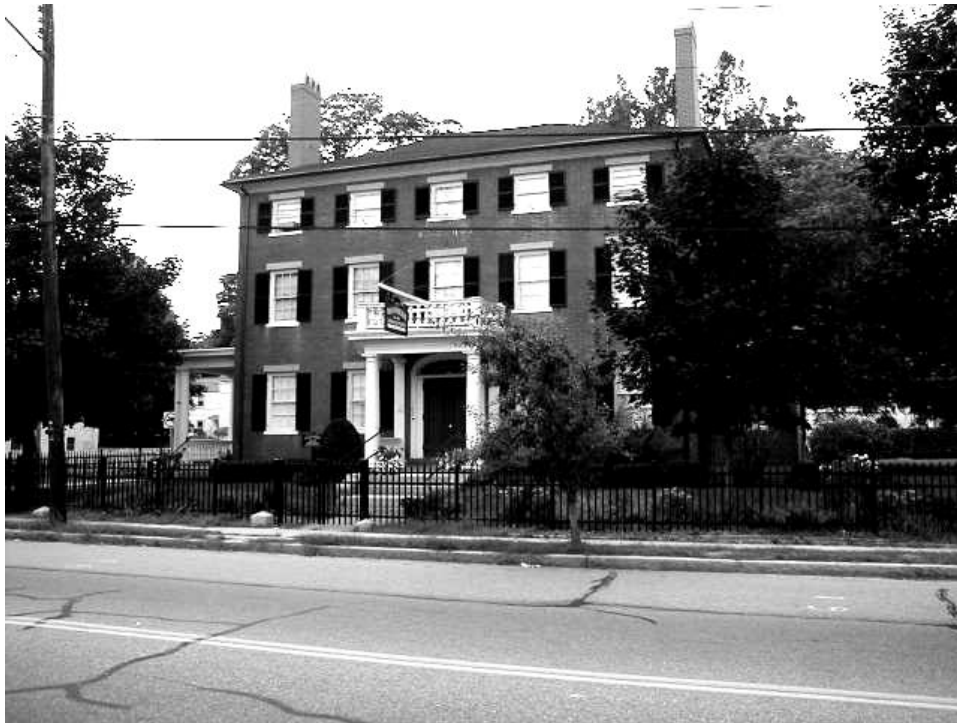
William Woodman House, 1818