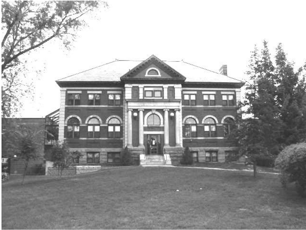
Dover Public Library 1905