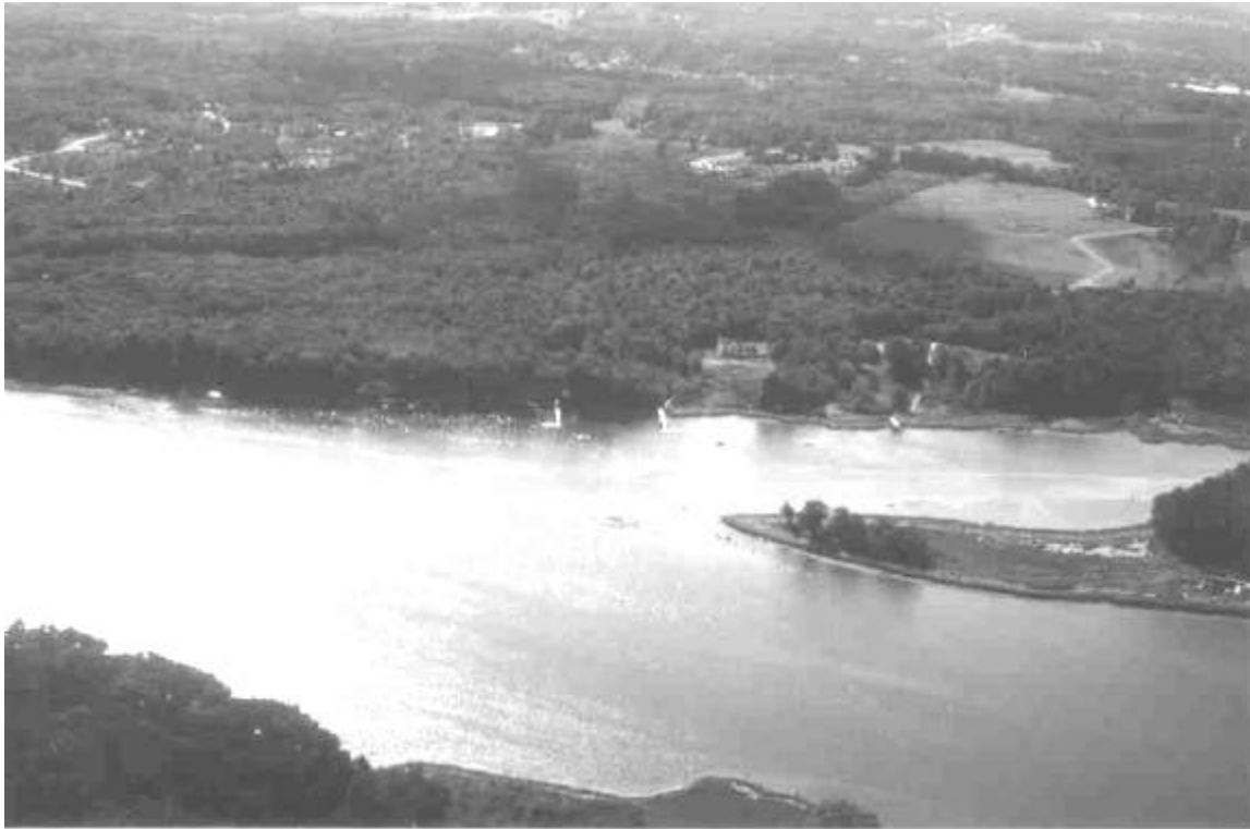
Cochecho/Piscataqua Rivers – Habitat for Shellfish, Finfish and Birds

The estuarine environment incorporates a variety of plant, mammal and bird habitat that are all inter-related in a balanced food chain. Marine life such as shellfish and fin fish are susceptible to any change in the environment. Consequently, significant events such as an oil spill or even incremental changes in water quality can have devastating effects on the estuary. Appropriate land management is essential to ensure the long-term health of this environment.