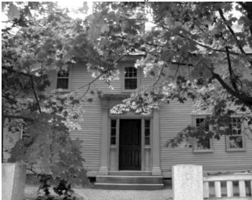
John Gage House c1723