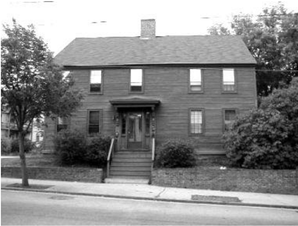
Michael Reade House 1785