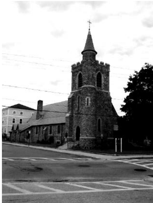
Episcopal Church, 1891