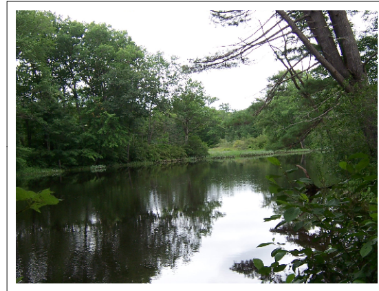
Cochecho River Conservation Area