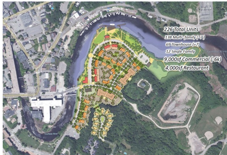
CONCEPT PLAN REVISIONS