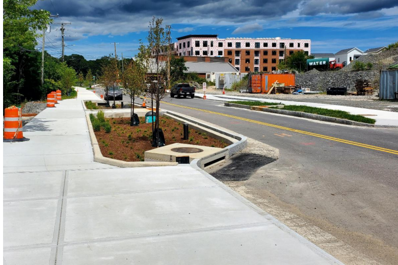
Payne Street looking towards Building C.

Along Payne Street, final curbing and sidewalks are now in place, and the newly completed stormwater treatment basin is fully operational. On River Street, the bio swales that manage surface stormwater drainage are substantially complete.