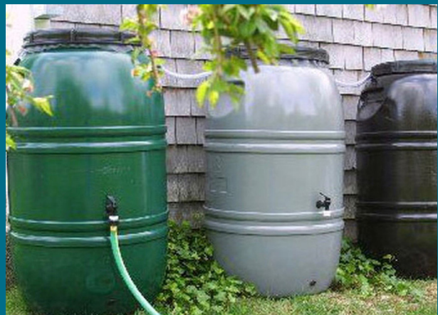
Above: Rain barrel system

Dover is participating in the Great Bay Rain Barrel Project program which invited 42 New Hampshire towns, and 10 in Maine along eight rivers that feed the Great Bay Estuary to be part of a rain barrel initiative. This program purchases a bulk supply of rain barrels and provides them to local groups to sell to property owners for a reduced cost. Rain barrels are a stormwater management mechanism, keeping stormwater from transporting excess nutrients into waterbodies.