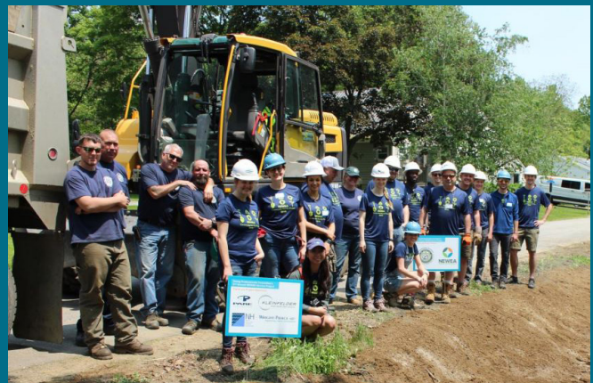
Above: Volunteers help create a rain garden at Hellman Avenue.

Rain gardens are small, landscaped depressions that are filled with a mix of native soil and compost, and are planted with trees, shrubs and other garden-like vegetation. They are designed to temporarily store stormwater runoff and reduce runoff pollutant loads. In 2020, the City of Dover Community Services Department partnered with the New England Water Environment Association to complete a rain garden service project along the right-of-way of Hellman Avenue. In this project, the City utilized a filtering catch basin to collect and direct polluted stormwater to a rain garden. This project demonstrated the power of partnership and incorporated collaboration, education, and outreach with the Youth Education Committee.