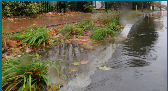
Above: Rain garden that was constructed as part of the Silver Street Improvement Project

The Silver Street Reconstruction Project was completed in 2016 and included a redesign of the road's right-of-way to reduce traffic speeds, improve pedestrian safety, and enhance water, sewer, and traffic management infrastructure. Among these comprehensive streetscape improvements, stormwater management and treatment was also a top priority. A large bioretention rain garden with an outdoor classroom was installed at the Woodman Park School and other improvements were made within the street right-of-way.