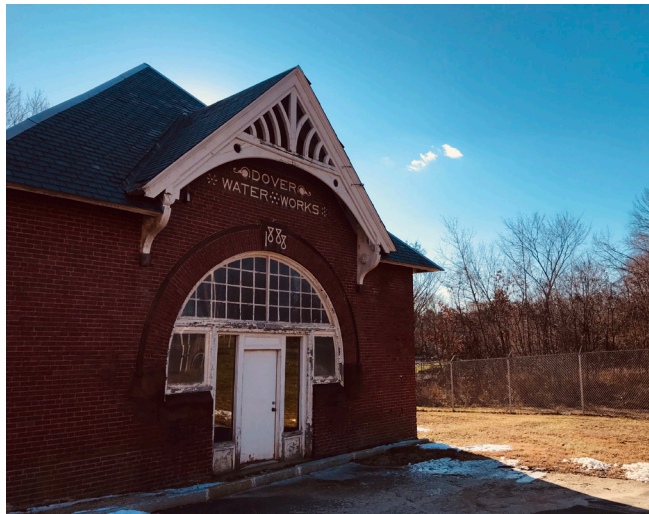
Above: Old Water Works Building

In 2015, Underwood Engineers updated the City's Water Facilities Plan and identified a multi-phase program for recommended improvements to the City's water facilities and infrastructure. All of Dover's wellhead buildings, aside from Hughes