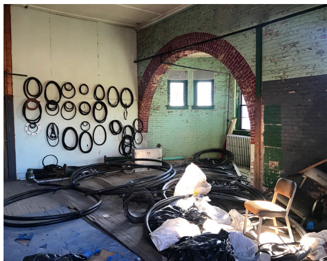
Above: The interior of the Old Water Works Building

Well, and the Insinglass Recharge Station, have been reconstructed to expand interior space and upgrade the buildings. In the wellhead building projects, creating separated and secure storage space for chemicals, improving energy efficiency, and bringing electrical systems up to code were priorities. Short-term health and safety upgrades were made to all facilities including correction of electrical code violations, repair or installation of chemical containment, and installation of chemical analyzers to monitor finished water quality.