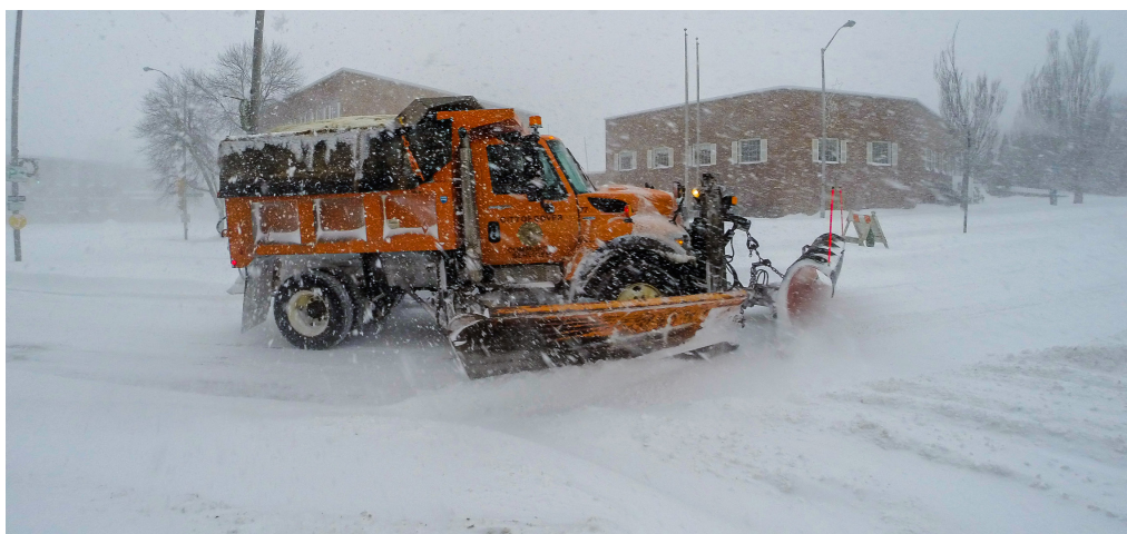
Above One of the many city-owned vehicles that Fleet Services maintains.