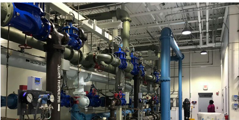
Above: The recently constructed Lowell Water Treatment Plant