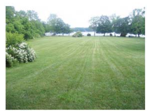
Hilton State Park