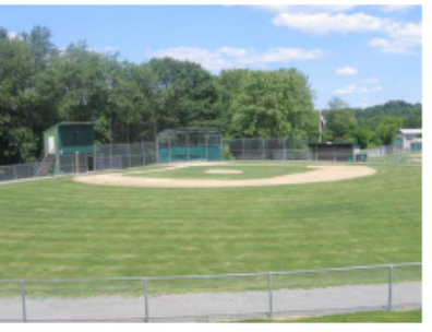
Dover Little League Baseball Fields