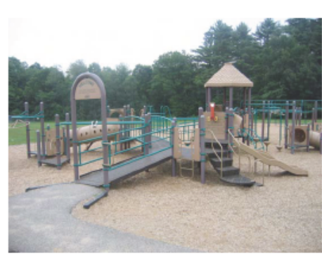
Garrison Elementary School Playground