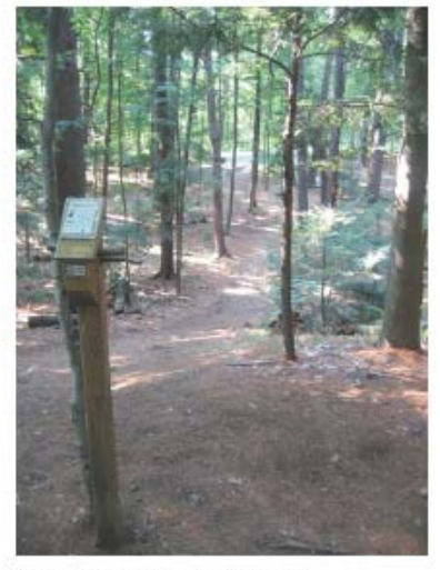
Bellamy Park Disc Golf Course