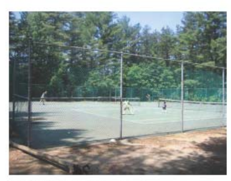
Long Hill Park Tennis Courts