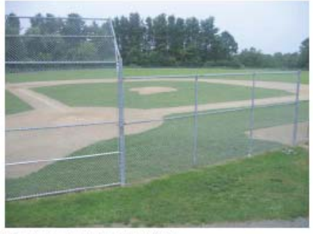
Woodman Park Baseball Field