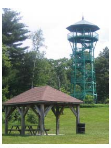
Garrison Hill Park