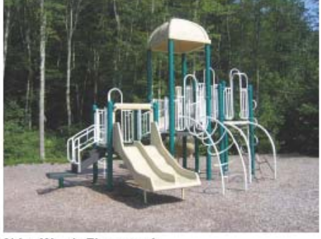
Alden Woods Playground