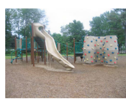
Horne Street School Playground