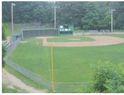
Cochecho River Walk