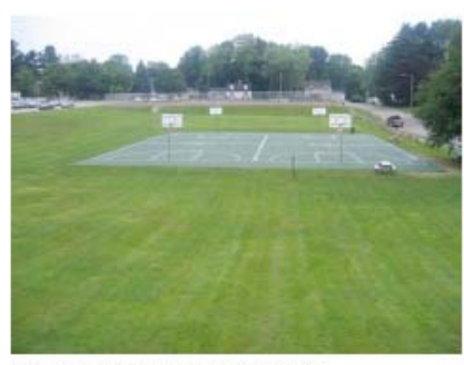
Woodman Park Basketball Courts