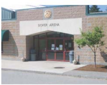
Dover Ice Arena