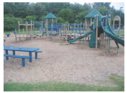
Woodman Park Playground