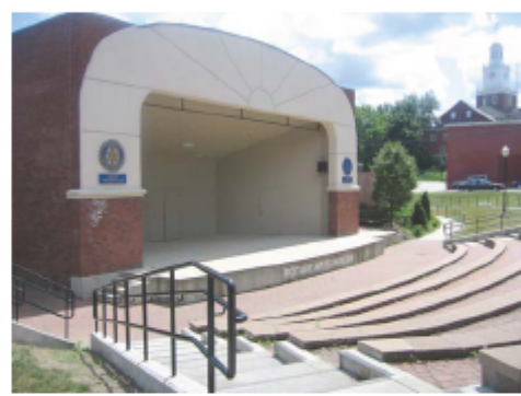
Rotary Arts Pavilion