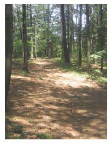
Willand Pond Hiking Trail