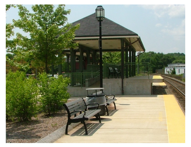
High level platform — looking west

Dover Station Facility — 33 Chestnut Street, Dover, NH