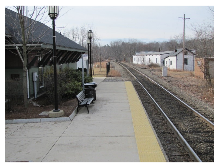
Low level platform — looking west