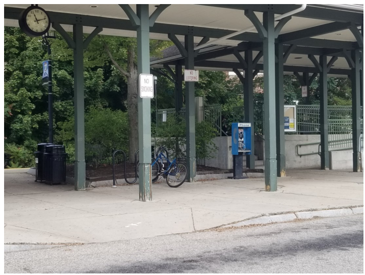
View of access from parking