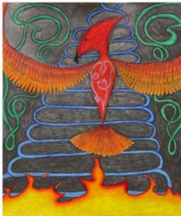
Cat Dueñas, Grade 8