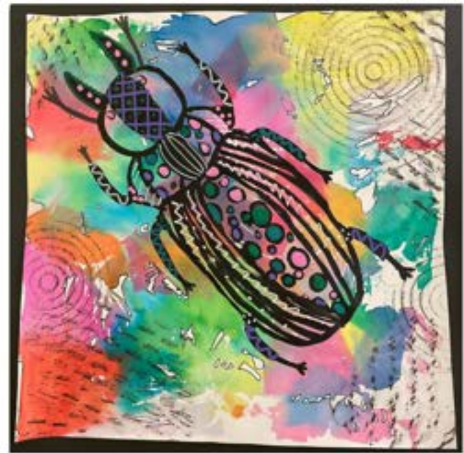
Aubrey Furina, Grade 7