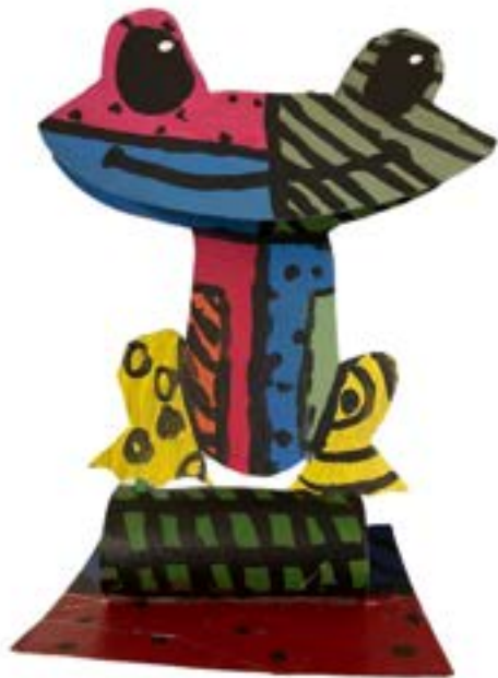
Matthew Amburg, Grade 6

Green is the color of grass. The color of limes, leaves, and avocado. Green tastes like lettuce from a garden. Green looks like a flower's stem. Green feels like prickly pine needles that I touch. Green sounds like leaves rustling in a tree. Green smells like brussel sprouts cooking in a pan. Green is the color of grass. The color of limes, leaves, and avocado.