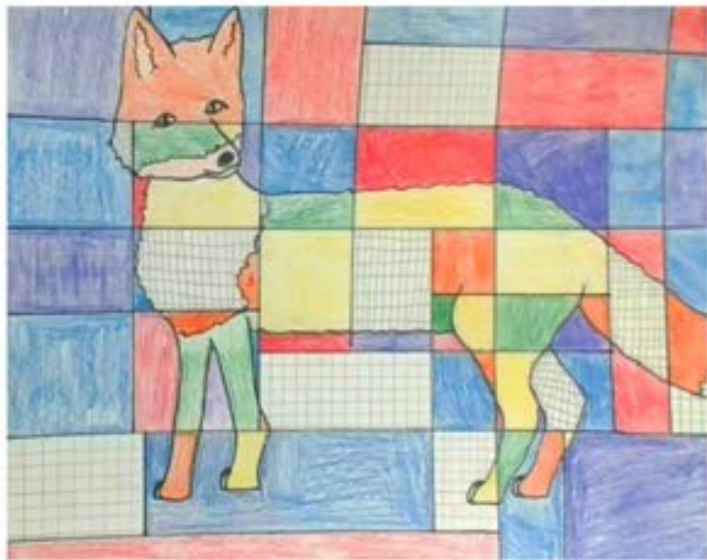
Emily Pomerleau, Grade 7