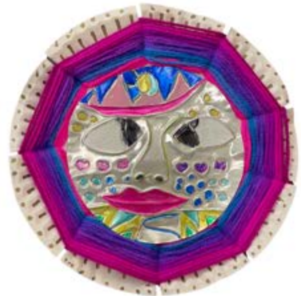
Ashlyn Callaghan, Grade 5