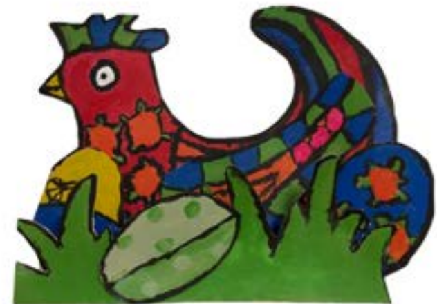
Elijah Tappin, Grade 5