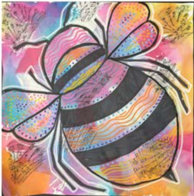
Reese Billings, Grade 7