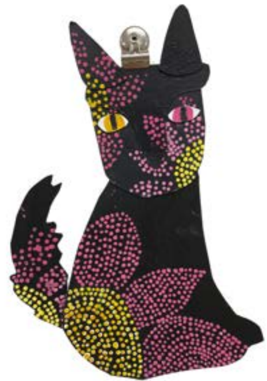
Dover Middle School Student