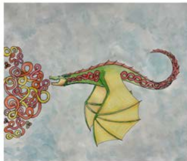
Bella Lynch, Grade 8