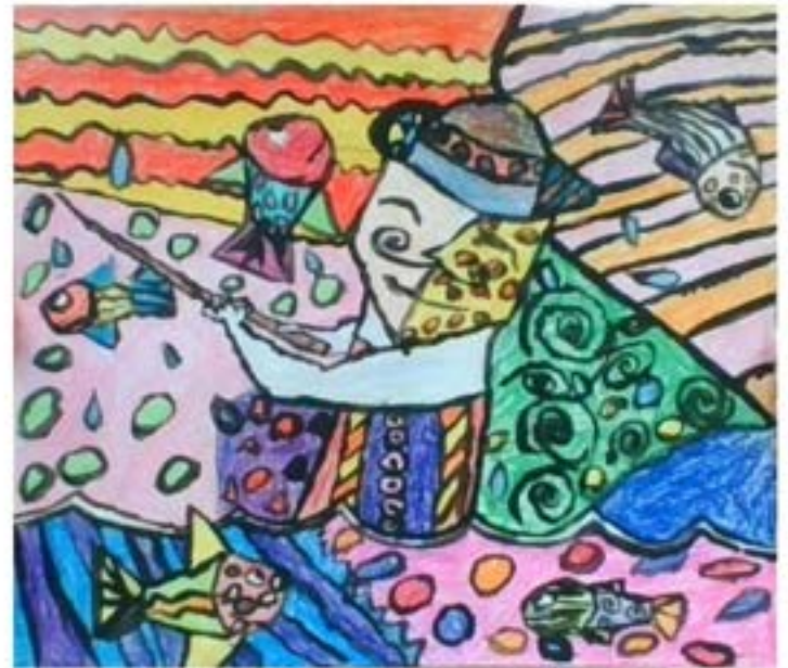
Declan Hourihane, Grade 6