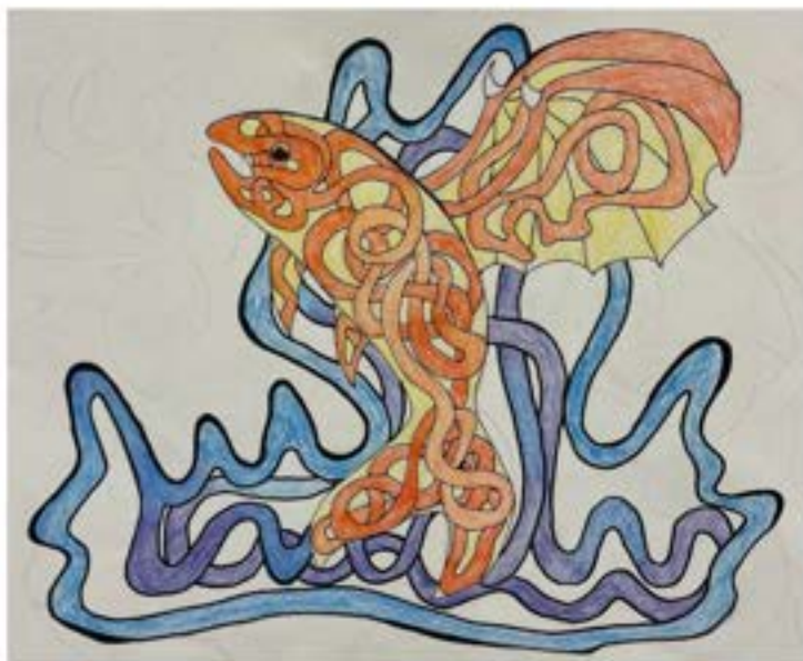
Audrey Rouillard, Grade 8