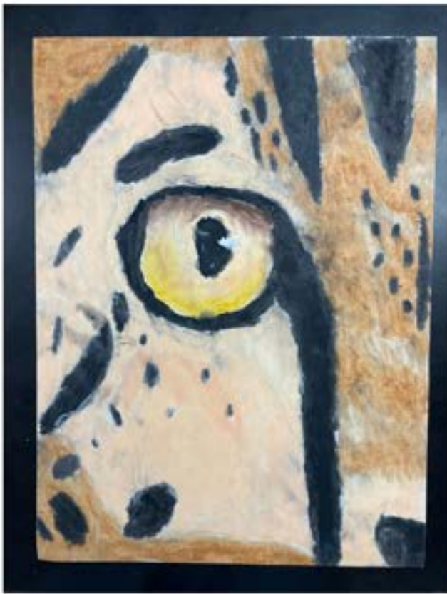
Norah, Grade 6