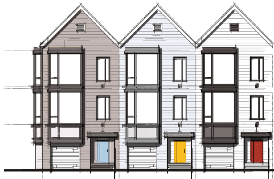
3-STORY TOWNHOUSE UNITS