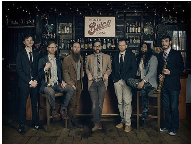
Soggy Po' Boys