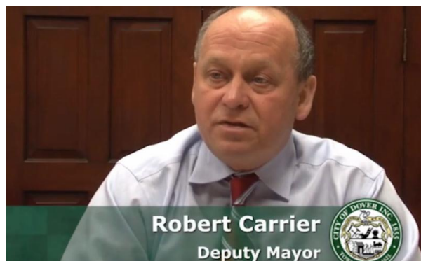
City of Dover Boards and Commissions

For more information about the important role of the City's boards and commissions, please view the video below. Click on the image to view.