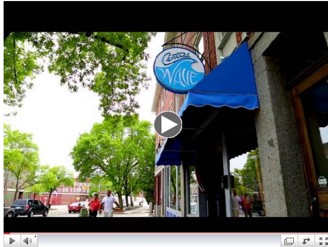
Dover Main Street serves up Dover Dines '14

For more information, including a list of participating restaurants, visit http://www.doverdines.com .