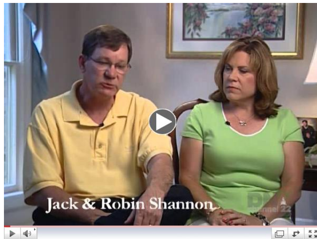
Fireworks, You and the Law: A Safety Message from the City of Dover, NH