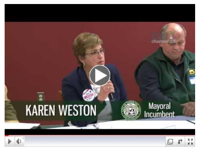
The first Community Conversation with mayoral and City Council candidates can be viewed above.

For more information, contact the City Clerk's office at 516-6018.